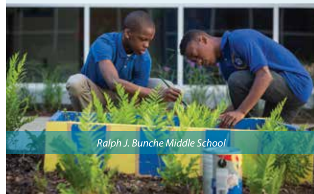
Ralph J. Bunche Middle School