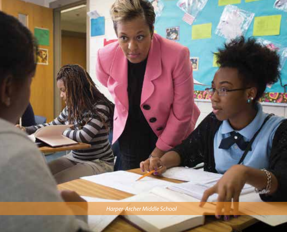
Harper-Archer Middle School

Atlanta Public Schools is on a mission to ensure that with a caring culture of trust and collaboration, every student will graduate ready for college and career.